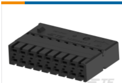
TE Part #1-2359440-1 18POS,AMP MCP 1.5K,REC HSG, UNSLD