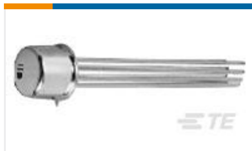
TE Part #1-1617122-0 JMACD-26XLS = M39016/15-105L