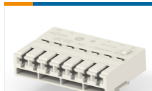
TE Part #2359441-1 7POS,AMP MCP 2.8,REC HSG,UNSLD