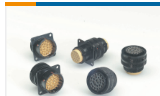
TE Part #ZPF000000000019008 FDDBA 54-20-41 SN-K-B5801