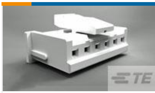
TE Part #1744417-7 7 POS EP 2.5 HSG, GLOW WIRE